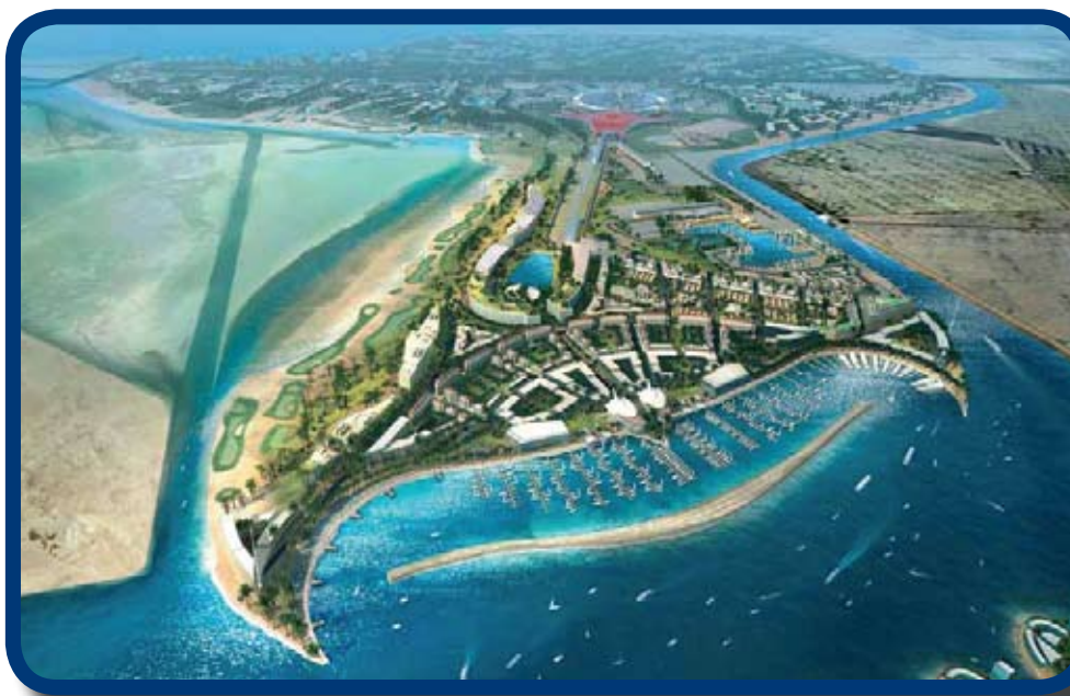
Water Park Yas Island, Abu Dhabi